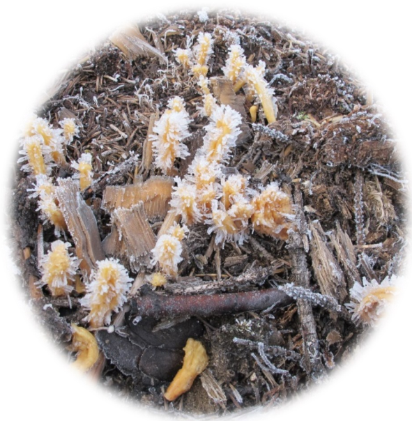
Frozen earth tongues or club corals on cutblock in Aleza Lake Research Forest east of Prince George